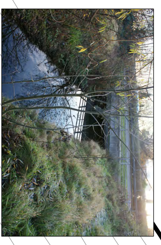
11. A10 culvert