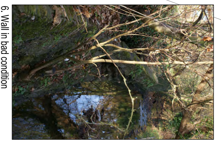
6. Wall in bad condition