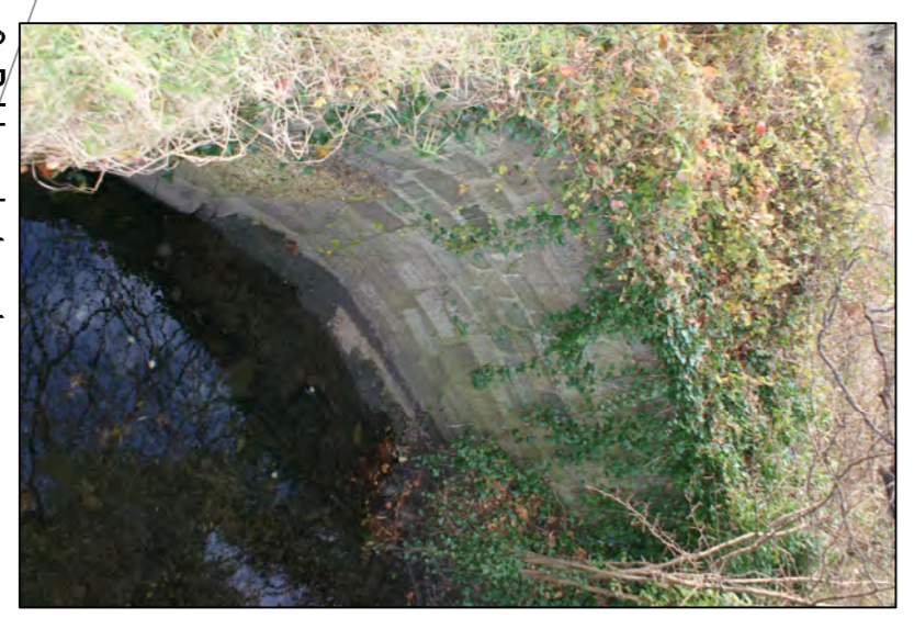
9. Bridge abutment