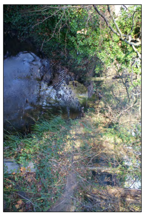
8. Upstream from bridge (rubbish in channel)