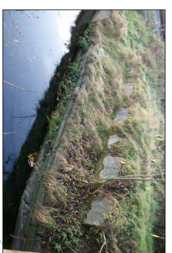
10. Two tier wall to be retained