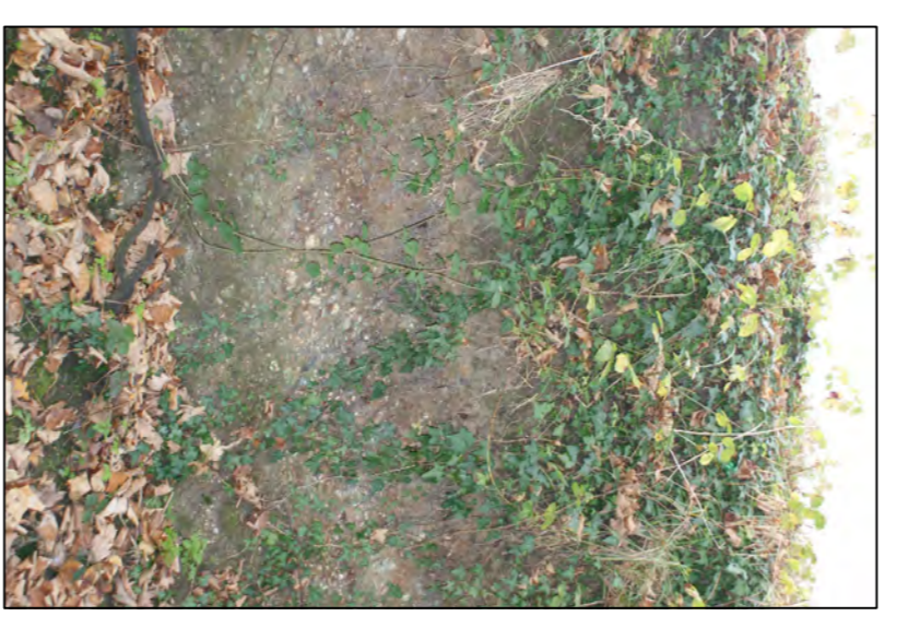
7. Gravels in bank